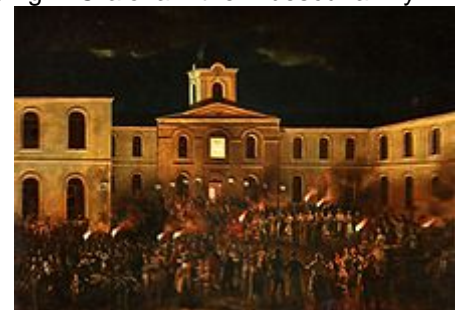
Unity Dance at Craiova, 1857, by Theodor Aman

Costache Romanescu, a citizen of Craiova, was among the leaders of the Provisional Government during the <u>1848 Wallachian revolution</u>. Wallachia's last two rulers, <u>Gheorghe Bibescu</u> and <u>Barbu Dimitrie Ştirbei</u>, came from an important boyar family residing in Craiova – the Bibescu family.