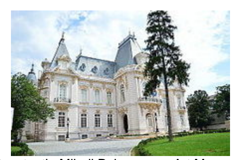
Constantin Mihail Palace, now Art Museum